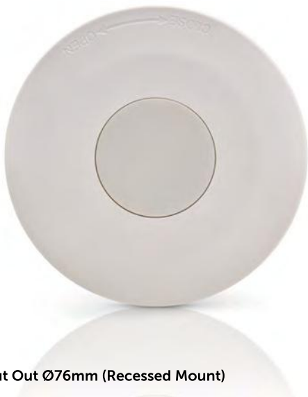
Cut Out Ø76mm (Recessed Mount)